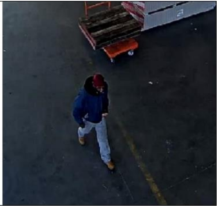
Burglary into Auto Suspect