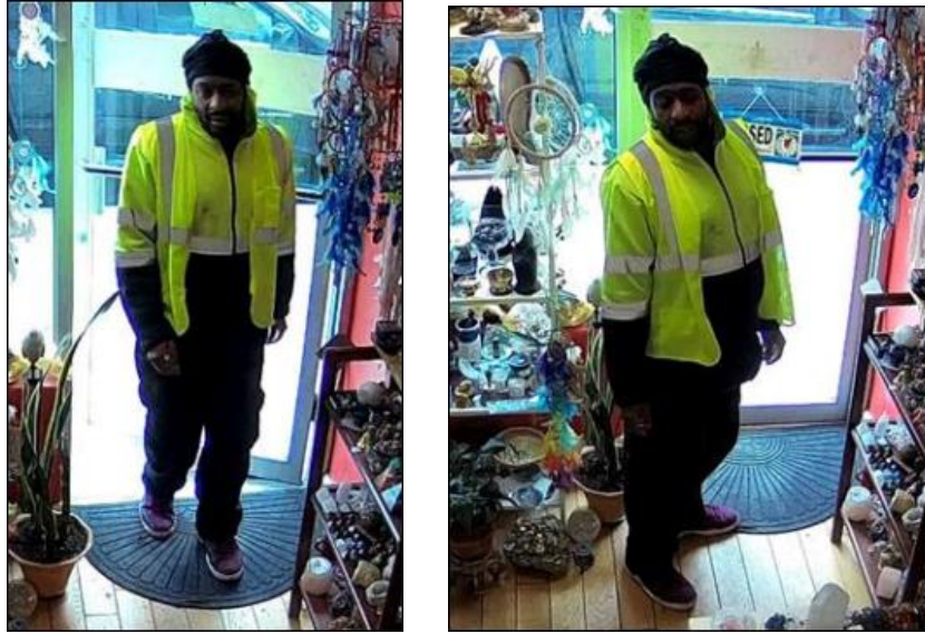
Burglary Suspect on April 10, 2022

Anonymous tips may also be made using the Police Division's website at: www.newarkpd.org or through our Smartphone App available at iTunes or Google Play. Search Newark Police Division to download the App.