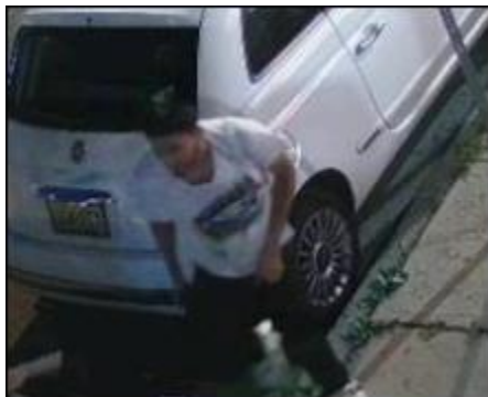
Suspect # 2