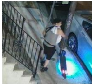
Suspect # 1