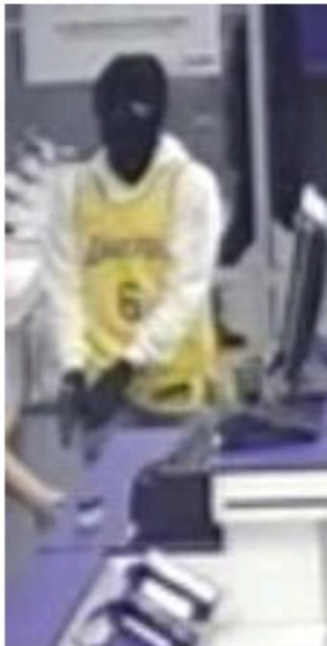
Suspect 2 w/gun