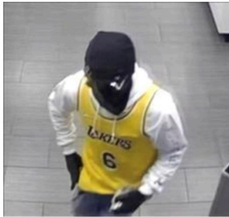
Suspect 2 w/gun/money