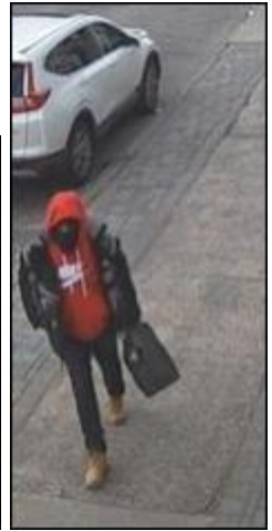
Burglary into Auto Suspect